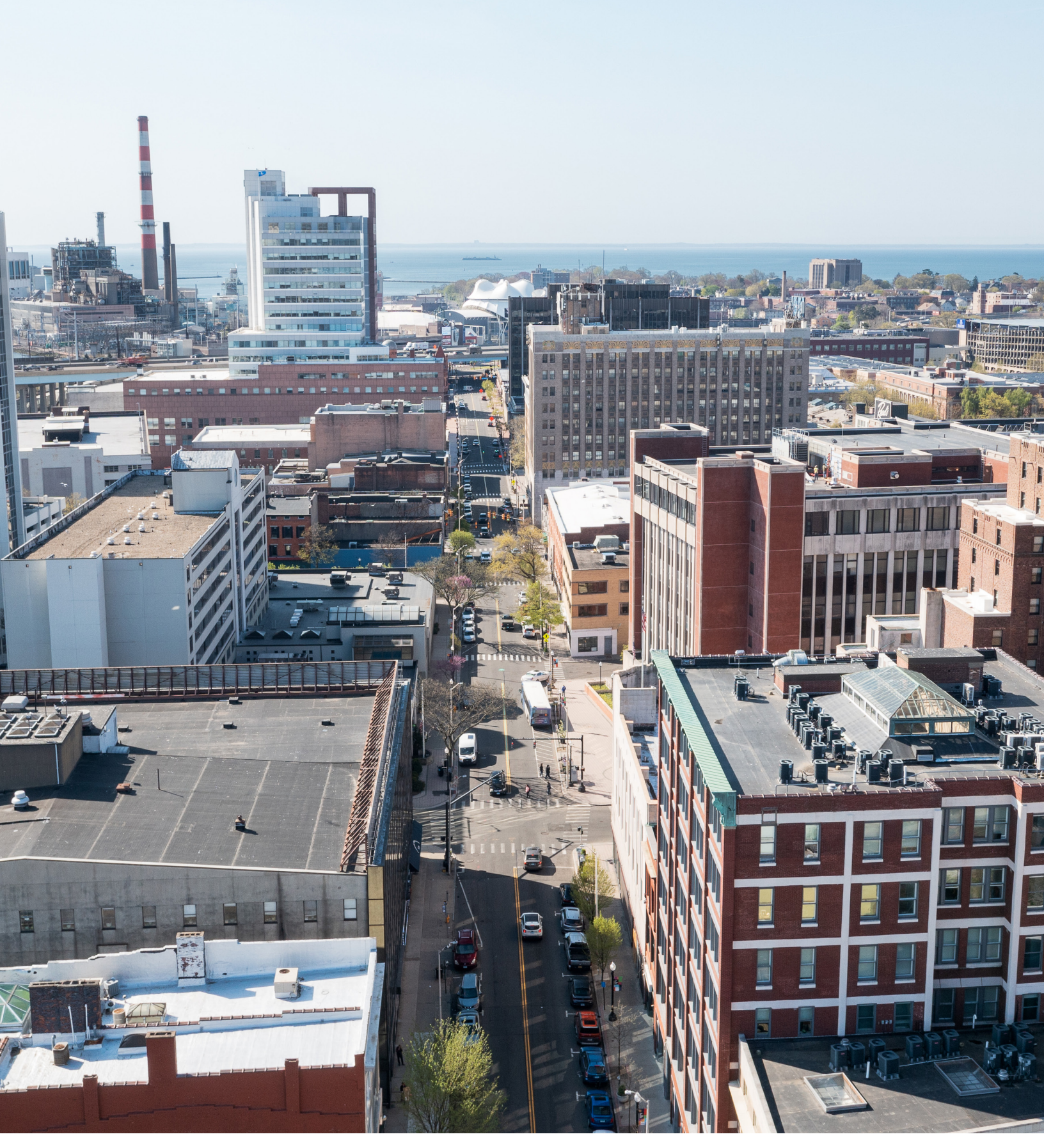
An aerial view of Bridgeport, the most populous city in Connecticut.