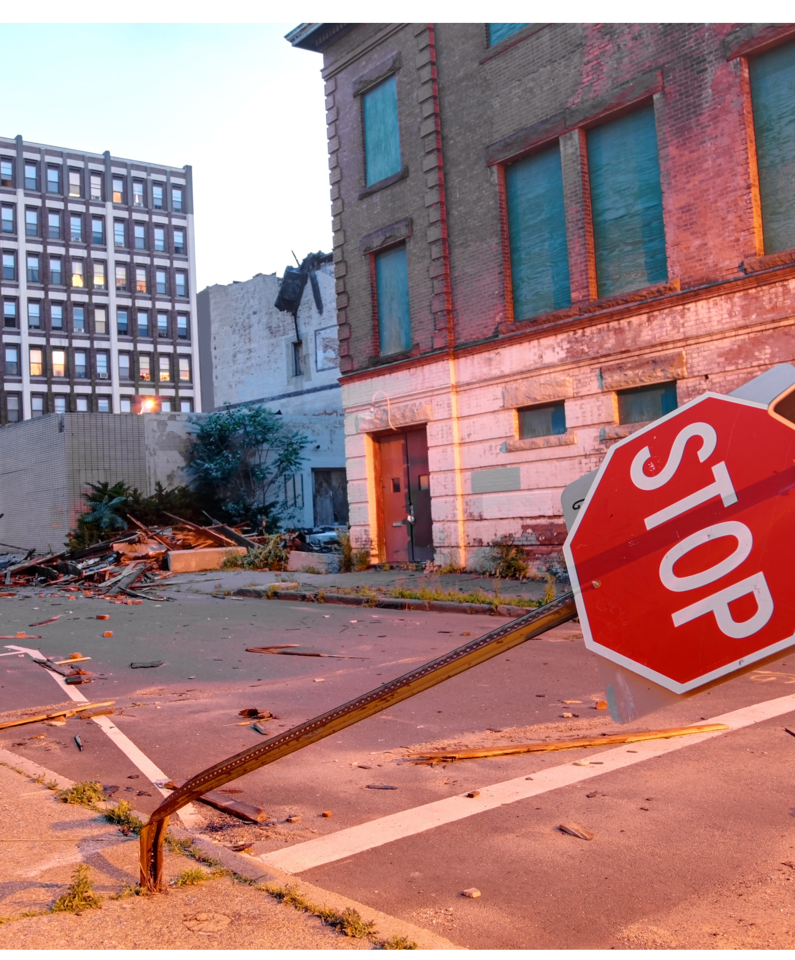
Tornado damage in downtown Bridgeport.