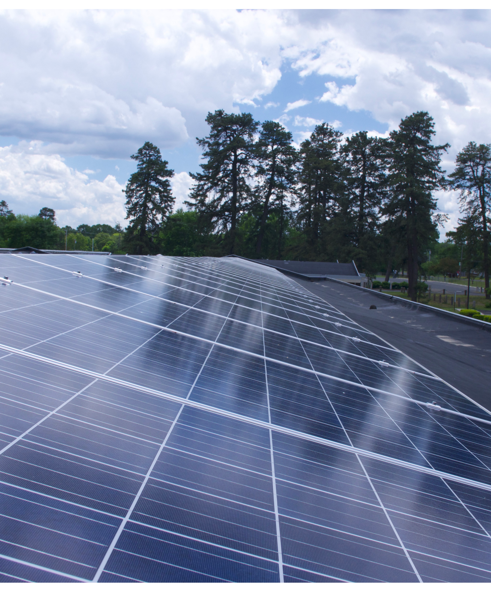
Solar panels on the roof of an affordable multifamily property in Windsor Locks.